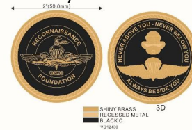
SHINY BRASS RECESSED METAL BLACK 3D 1012491