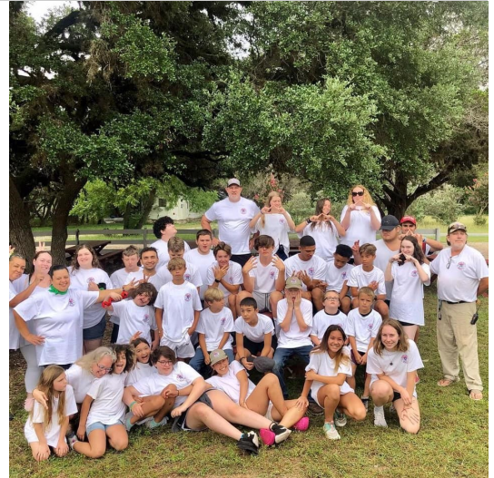
Kids attending the 2021 Recon Gold Star Children's summer camp (above) at Echo Hill Ranch joined others for 10 days of fun at the sprawling Texas property.

"Step one show up, everything after that is history"